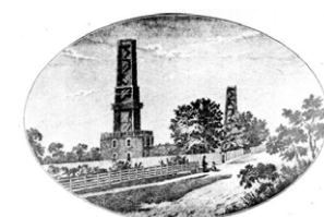
Lundy's Lane Observation Towers

Following the close of the War of 1812, the battlefield became a popular tourist destination. For many decades, veterans of the battle were available to conduct personal