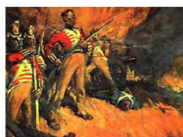
British Regulars defending Lundy's Lane.

Following the capture of his artillery by the Americans, Lt. General Drummond and his troops retreated from their defensive position on the height of land in the cemetery to this area on the north side of the hill.