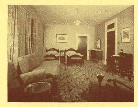
One of our Parlour Guest Rooms.

In winter there is skiing, snowshoeing, tobogganing and all manner of healthy outdoor sports. A fine arena featuring roller skating and big name bands for dancing.