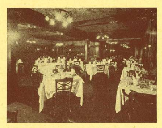
From the observation windows of the oak-beamed diningroom, guests have fine views over the Oakes Garden and Falls. The cuisine is unexcelled.