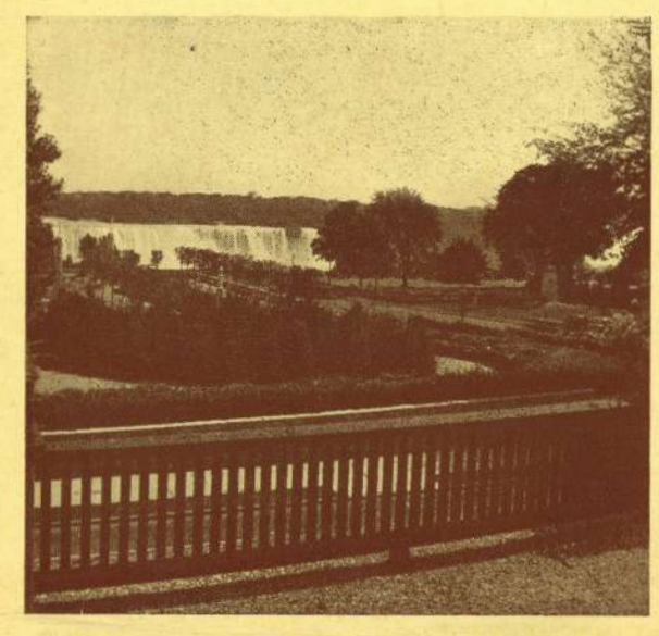
From one of our Parlour Guest Room windows this view of the Falls and Oakes Garden is a source of pleasure. Other rooms overlook vistas just as lovely.