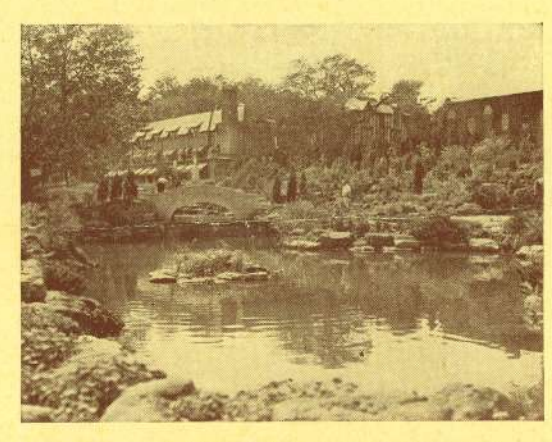
A Glimpse of Foxhead Hotel from the Rockery of Beautiful Oakes Garden.

The Oakes Garden and Outdoor Theatre; Queen Victoria Park; the new Rainbow